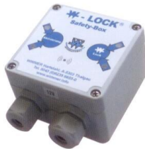
Safety-Box with acoustic locking control